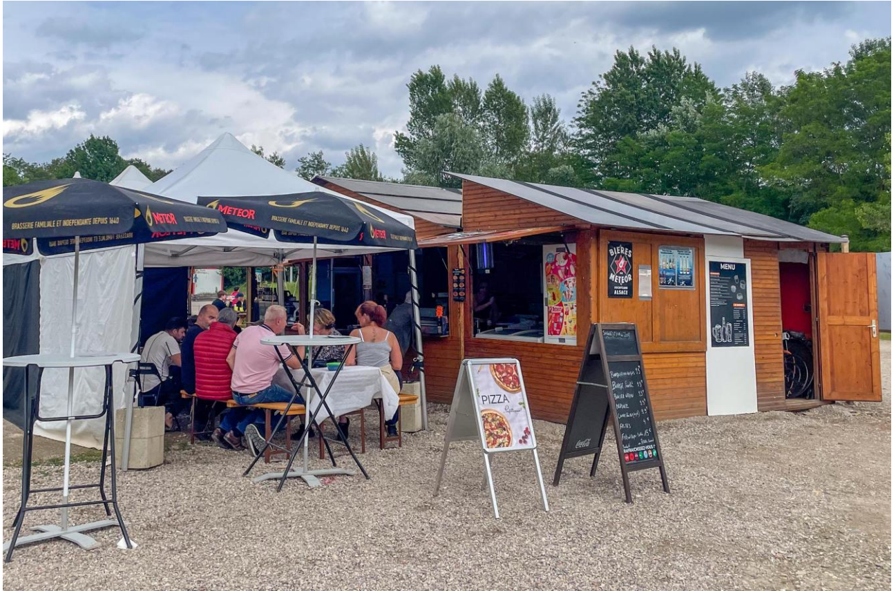
Sur place : le snack de la gravière du fort

On-site catering is available during the warmer months.